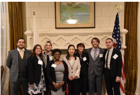
Consul-General Fukushima hosted a reception for JET Program alumni and supporters at her Official Residence in Nashville.

Since many events in 2020 were cancelled due to COVID-19, the Consulate has introduced several new social media campaigns with the goal of maintaining a connection between the Mid-South and Japan, even when travel and public events are not possible. Along with many other posts, followers can enjoy weekly series such as Japanese Culture Corner, a virtual folk craft exhibit, Japanese language tips, and kamishibai storytelling. You can follow the Consulate on Facebook , Instagram , and their website .