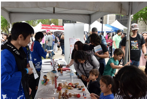
Consulate-General of Japan in Nashville's activity table at the Nashville Cherry Blossom Festival