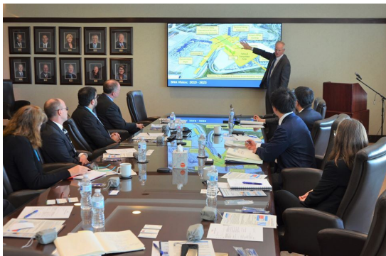
MNA staff meet with representatives from Narita Airport

When I came to BNA we had a passenger count of almost 6.5 million per year. With nearly 18.3 million passengers in 2019, BNA has been one of the fastest growing airports in North America.