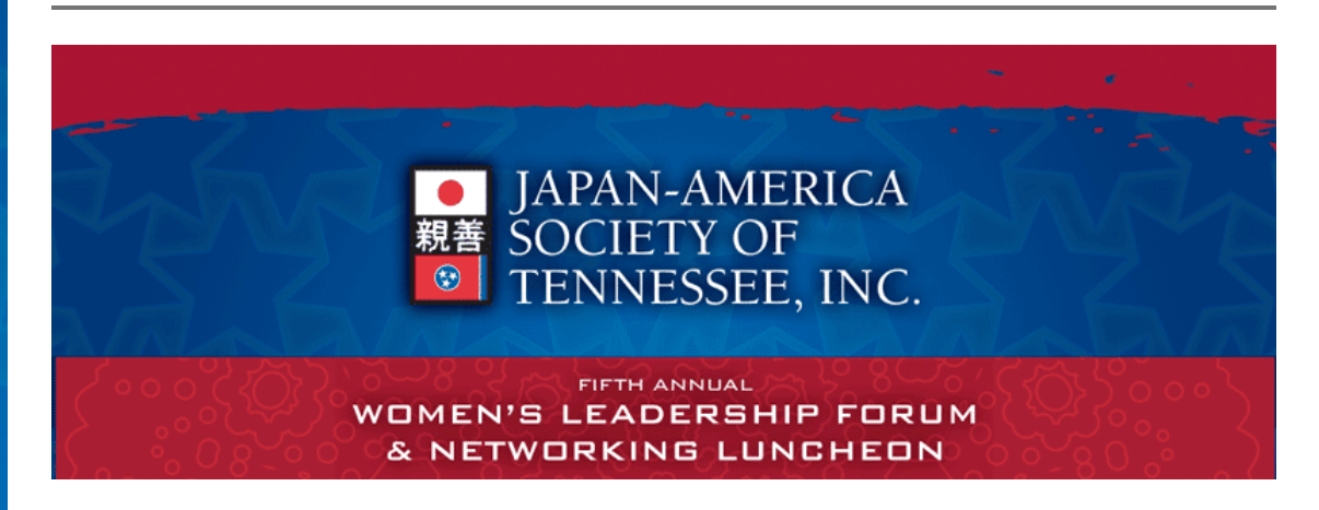
Nov 6, 2019 11am - 2:00pm